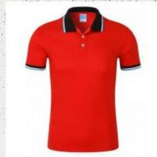
COLOR COMBI POLO SHIRT SPECIAL COLLAR