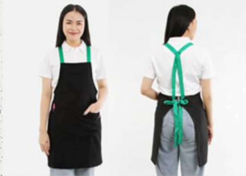
COLOR COMBI APRON W/ TWO FRONT POCKET