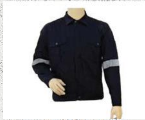
POLO WITH REFLECTOR