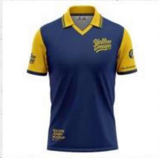
FULL SUBLI POLO SHIRT V-NECK COLLAR