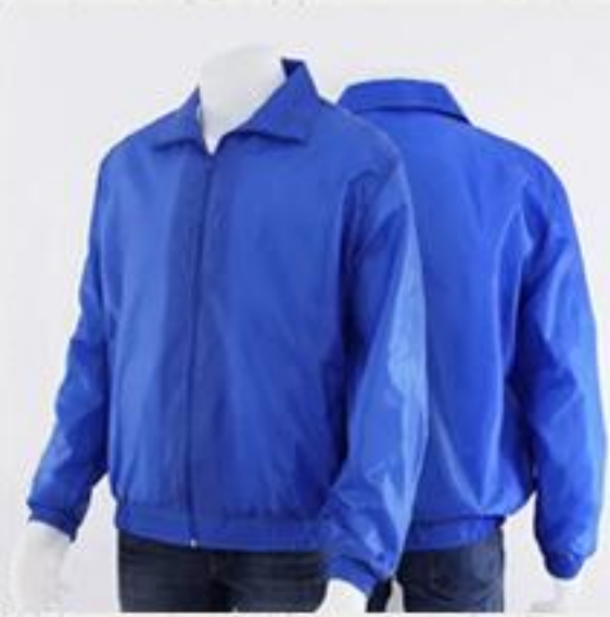
WINDBREAKER JACKET (MICROFIBER OR MT FUJI FABRIC)