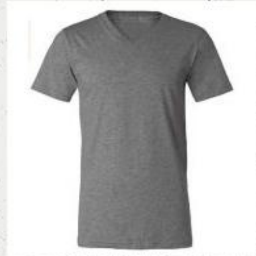
READY MADE VNECK (COTTON & DRIFIT)