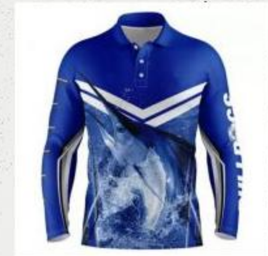
FULL SUBLI LONGSLEEVES POLO

POLO T-SHIRT IS A TOP CHOICE OF CLOTH FOR ALL PEOPLE. IT IS MORE FLEXIBLE THAN ANY OTHER CLOTHES. WE ARE EXPERTS IN MAKING DIFFERENT STYLES OF POLO SHIRTS. OUR EXPERIENCED STITCHING STAFF IS COMPETENT ENOUGH TO MAKE DIFFERENT COMBINATIONS OF COLLAR, CUFF, PLACKET, SLEEVES, AND PANELS TO GIVE YOU DESIRED DESIGN.