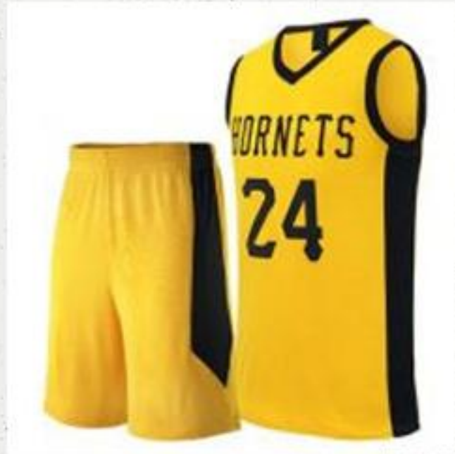
BASKETBALL JERSEY SET