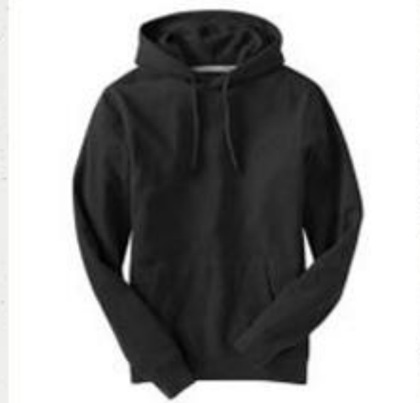
READY MADE HOODIE SWEATSHIRT