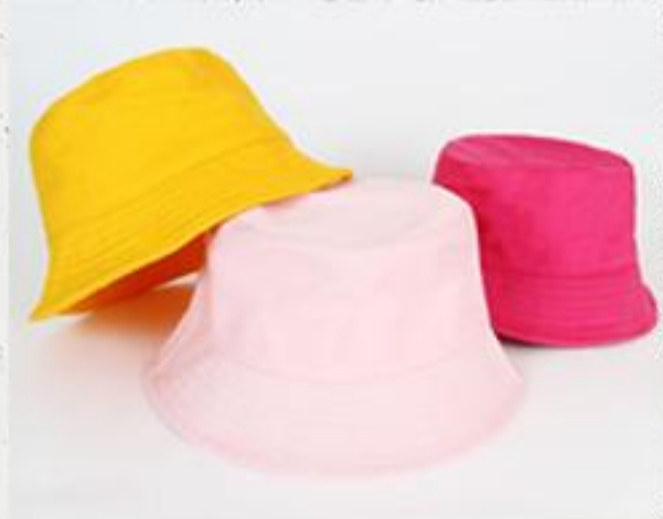
CUSTOM MADE BUCKET HAT