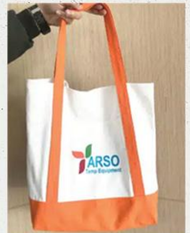
FULLY CUSTOM MADE TOTE BAG DESIGN 002 (MADE TO ORDER)

WE HAVE READY MADE FLAT TOTE BAGS FROM S-XL SIZE & FULLY CUSTOM MADE CANVASS TOTE BAGS ACCORDING TO YOUR STYLE AND DESIGN. MOQ APPLIES FOR MADE TO ORDER TOTE BAGS 50 PCS MOQ PER BATCH ORDER.