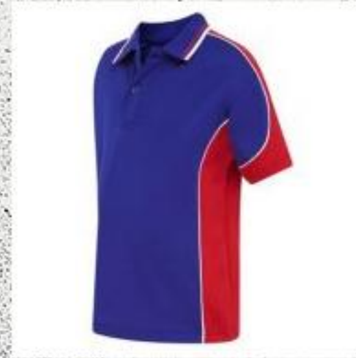
COLOR COMBI POLO SHIRT SPECIAL COLLAR