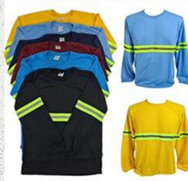
READY MADE LONGSLEEVES WITH REFLECTOR