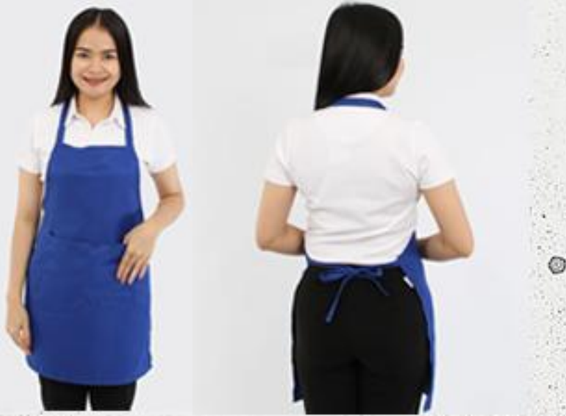
PLAIN APRON W/ TWO FRONT POCKET