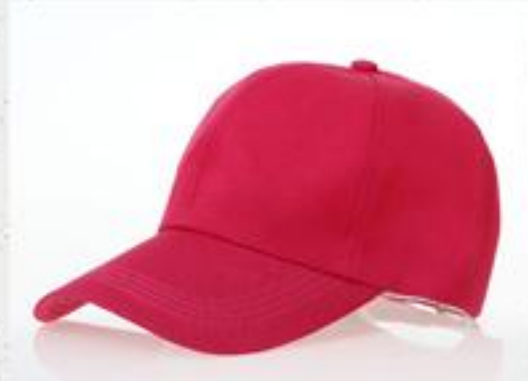
5-6 PANEL BASEBALL CAP