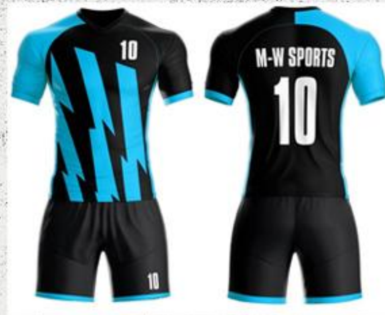
SPORTSWEAR JERSEY SET

WE MANUFACTURE AND CUSTOMIZE ANY DESIGN OF TEAM SPORTS WEAR JERSEYS OFFERING FREE BASIC DESIGNING. WE HAVE OUR SPORTS JERSEYS AND FITNESS OUTFIT UNIFORMS STITCHING, EMBROIDERY AND PRINTING PRODUCTION ENABLING TO MATCH AS PER CUSTOMER DESIGN REQUIREMENTS.