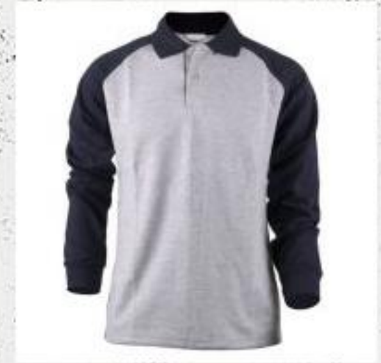
LONGSLEEVES POLO SHIRT