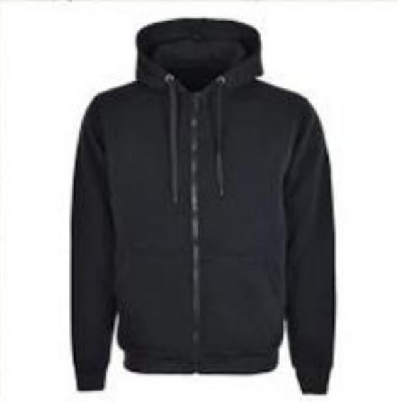
READY MADE FULL ZIP HOODIE SWEATSHIRT