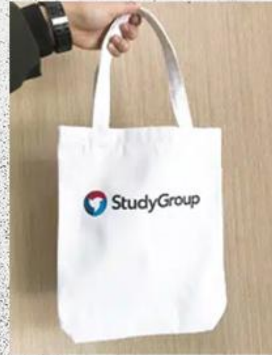
READY MADE TOTE BAG W/ DTF PRINT