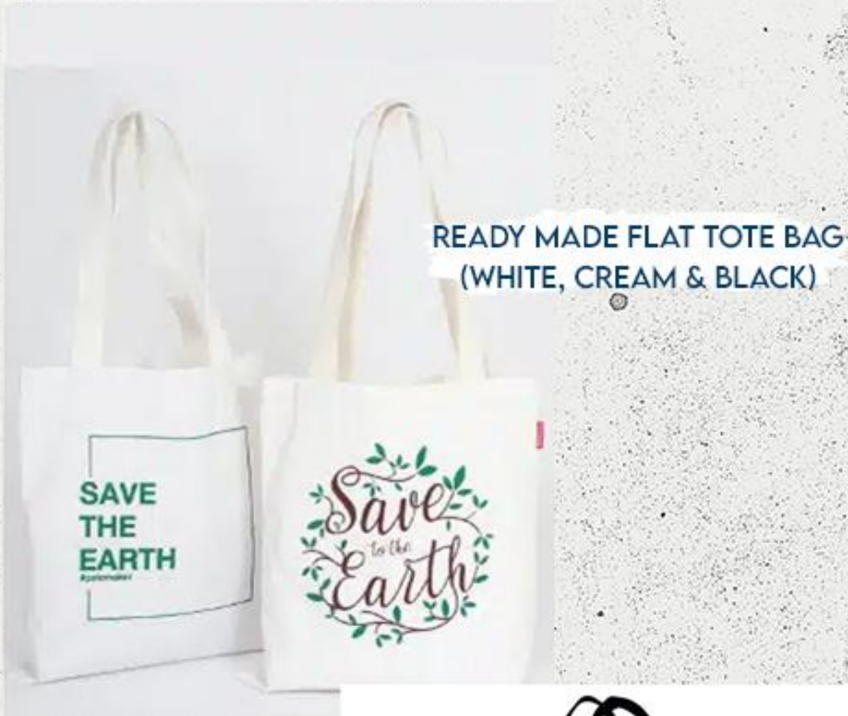
READY MADE FLAT TOTE BAG (WHITE, CREAM & BLACK)

READY MADE & CUSTOM MADE CANVASS TOTE BAGS