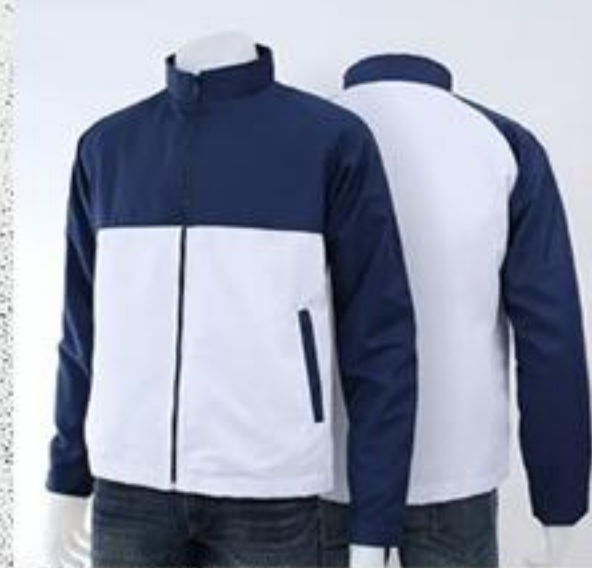
WINDBREAKER JACKET- CHINESE COLLAR (MICROFIBER OR MT FUJI FABRIC)