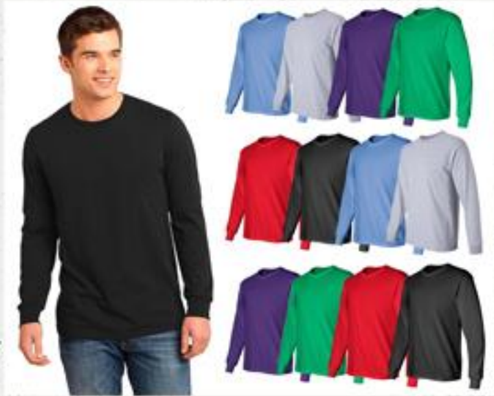
READY MADE LONGSLEEVES (DRIFIT OR COTTON)