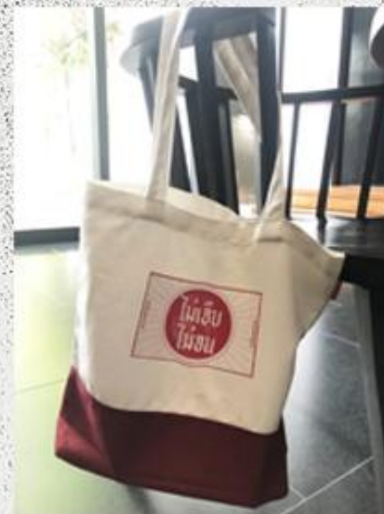
FULLY CUSTOM MADE TOTE BAG DESIGN 001 (MADE TO ORDER)