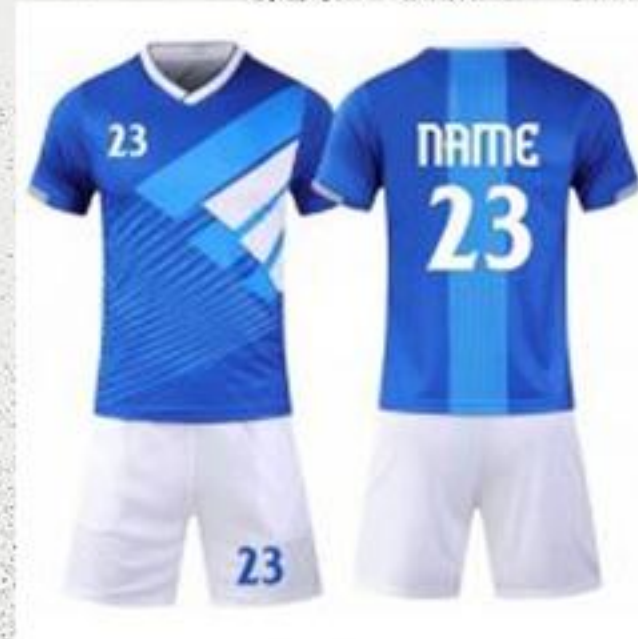
SPORTSWEAR JERSEY SET