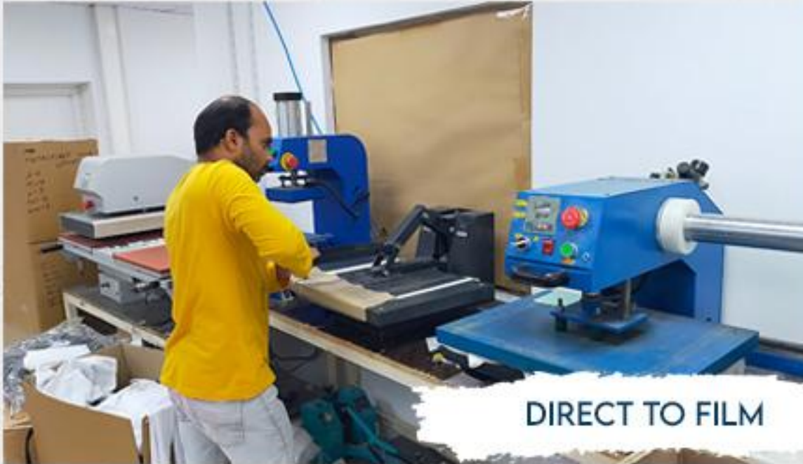
DIRECT TO FILM