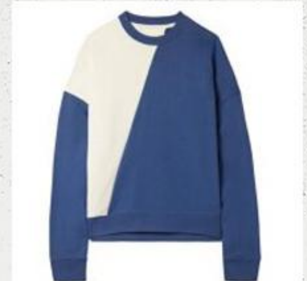
COLOR COMBI SWEATSHIRT