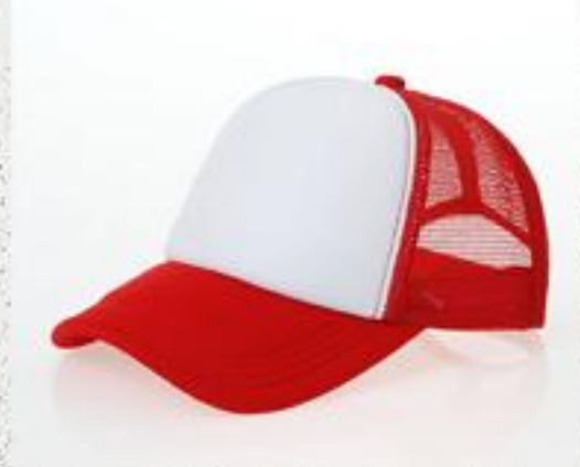
NETTED CAP (FOAM)