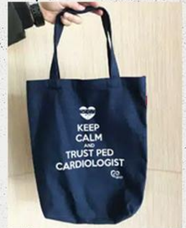
SPECIAL COLOR FLAT TOTE BAG (MADE TO ORDER)

SMALL 10 X 12" MEDIUM 12 X 14" LARGE 14 X 16" XL 15 X 18"