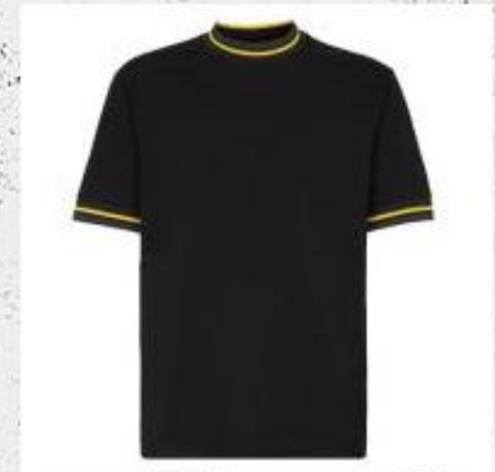
COLOR COMBI TSHIRT (COTTON, POLYESTER & DRIFIT)

YOU HAVE MULTIPLE CHOICES OF FABRICS LIKE COTTON JERSEY, INTERLOCK, COTTON DRI-FIT, POLYESTER DRI-FIT, MICRO HONEY COMB, SPORTS JERSEY AND POLYESTER MESH AND MANY MORE.