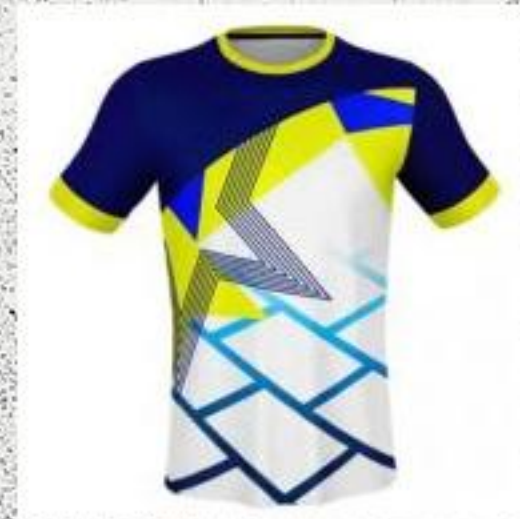
FULL SUBLIMATION TSHIRT (DRI-FIT OR US POLYDEX)