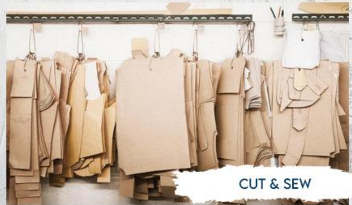
CUT & SEW