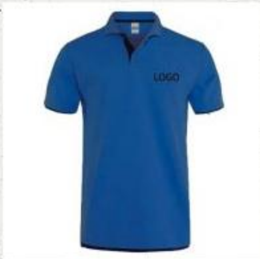
READY MADE POLO SHIRT (HONEYCOMB, DRIFIT OR POLYESTER)