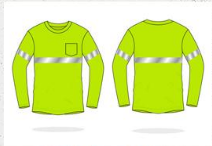
CUSTOM LONGSLEEVES WITH REFLECTOR