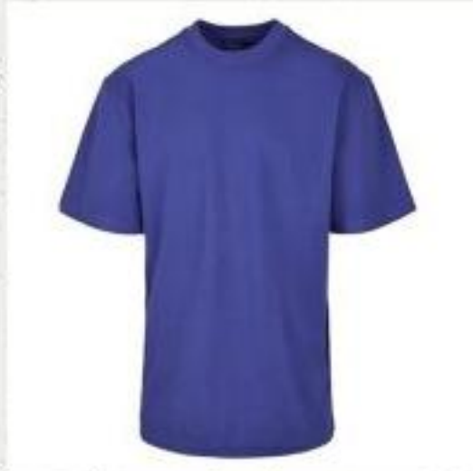
READY MADE ROUNDNECK (COTTON, POLYESTER & DRIFIT)