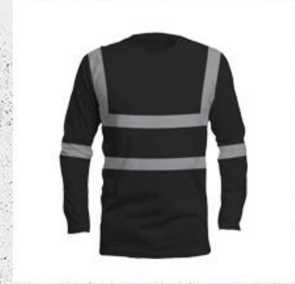
CUSTOM MADE LONGSLEEVES WITH REFLECTOR