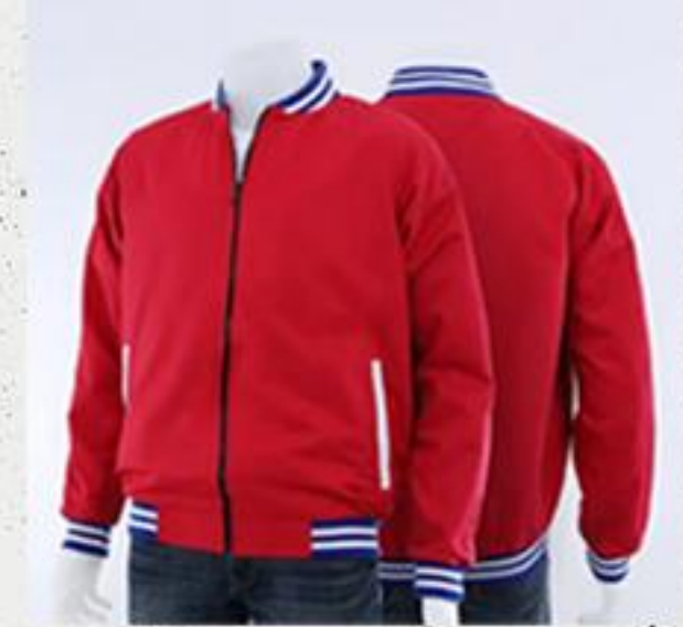
BOMBER JACKET (COTTON TWILL, MICROFIBER, MT FUJI OR TERRY FABRIC)