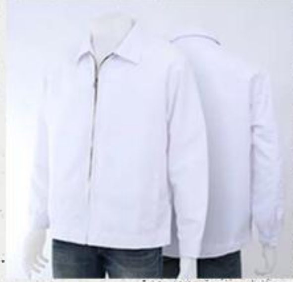
CORPORATE JACKET (COTTON TWILL)