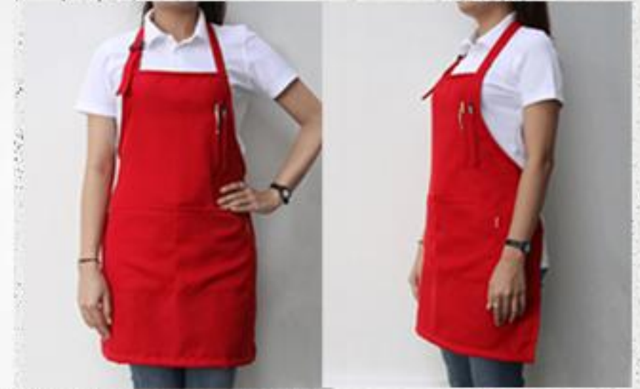
PLAIN APRON W/ TWO FRONT POCKET + SPECIAL POCKET