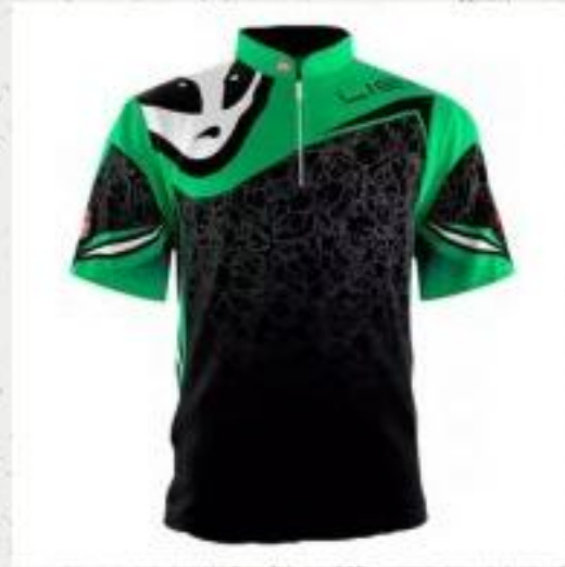
FULL SUBLI POLO HALF ZIP - CHINESE COLLAR