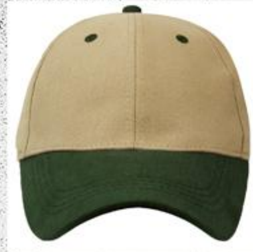
COLOR COMBI CUSTOM MADE CAP

WE RECOMMEND CAP/HAT FABRICS TO MEET COMPREHENSIVE USAGE NEEDS. THERE ARE HAT FABRICS THAT ARE STRONG AND DURABLE, HOLD A BEAUTIFUL SHAPE, AND FABRICS FOR SPORTS CAPS AND FABRIC FOR GENERAL DISTRIBUTION WORK