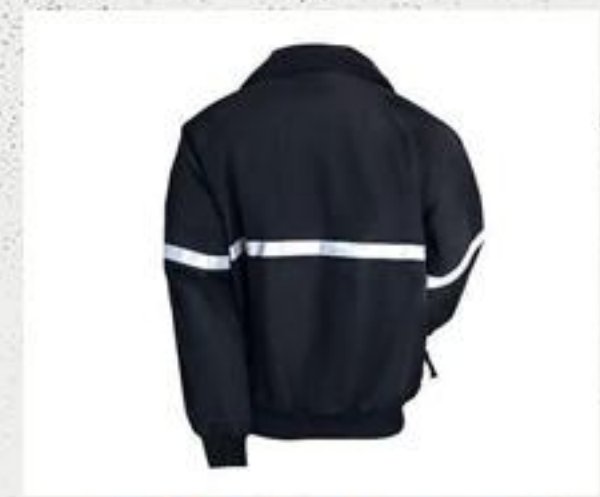
JACKET WITH REFLECTOR

WE MANUFACTURE AND SUPPLY CUSTOMIZED INDUSTRIAL AND LABOR MAINTENANCE WORK WEAR UNIFORMS SUCH AS CONSTRUCTION SHIRTS WITH REFLECTORS , POLO WITH REFLECTOR AND JACKETS.