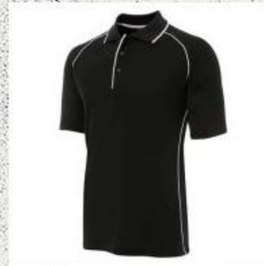
COLOR COMBI POLO SHIRT SPECIAL COLLAR