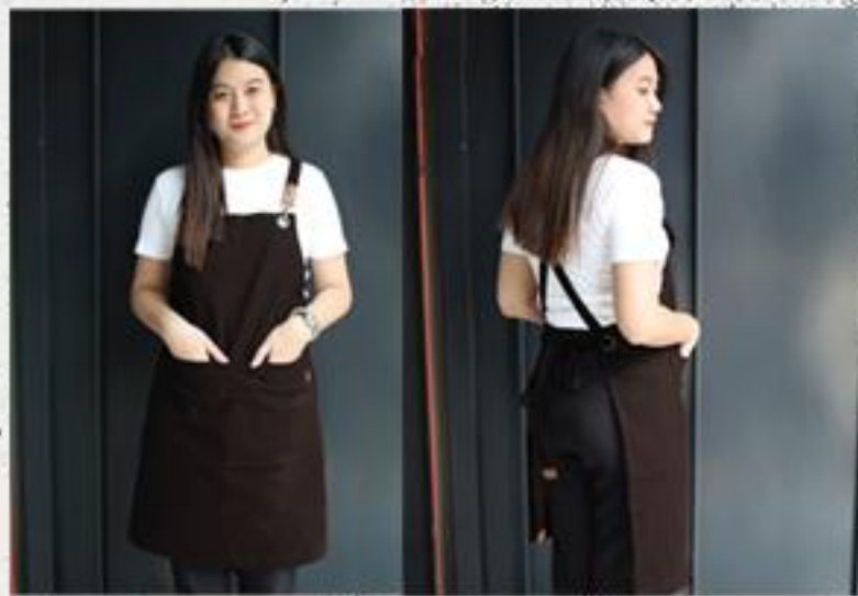
COLOR COMBI APRON W/ TWO FRONT POCKET + SPECIAL STRAP